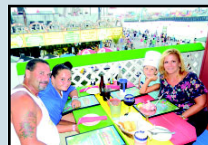
Patrons enjoy the view while choosing from a menu filled with authentic Mexican dishes created from the freshest ingredients available.