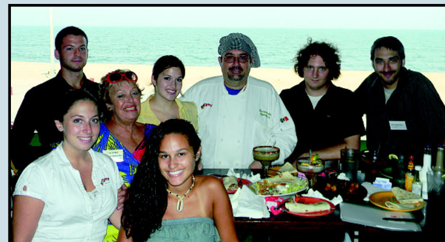
Food and fun doesn't get much better than the generous servings, prepared with seasonings and style & the exhilarating atmosphere that is contemporary in concept, yet rich in warmth and charm.